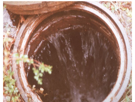
Inflow into a Sewer Manhole