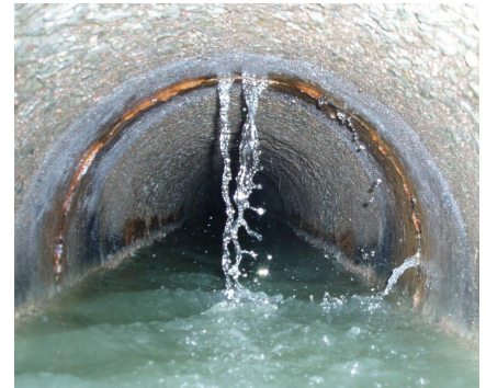
Infiltration into a Sanitary Sewer

Stormwater in Combined Sewers is, by design, collected in the combined sewer system to be transported to a downstream treatment facility. Additional system capacity is available via combined sewer overflow (CSO) storage facilities and outfalls that may be active during rainfall events.